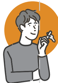
A new neighbor