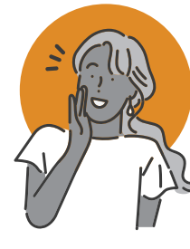
An old friend