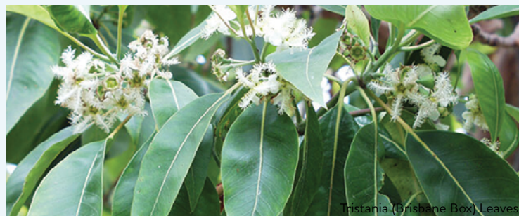
Tristania (Brisbane Box) Leaves