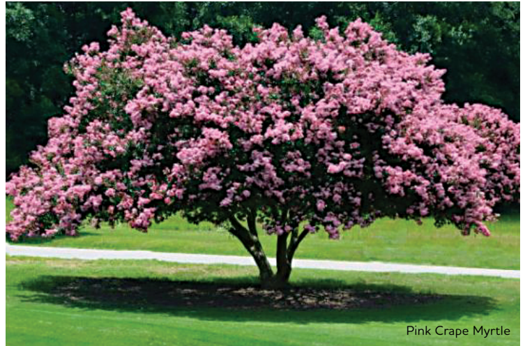
Pink Crape Myrtle

for more information see: www.lakeforestca.gov/ expandtheforest