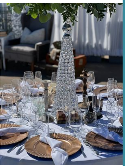
Step into the enchanting world where nostalgia seamlessly meets style. Explore The Shabby Vintage and uncover a curated collection that not only enhances your living space but also tells a story with every