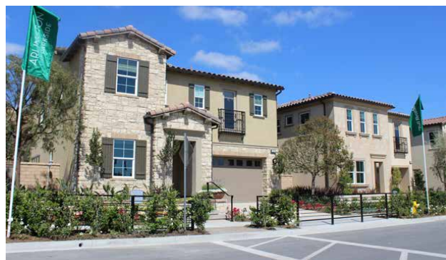
Parkside Model Homes

Toll Brothers new "Parkside" development features three single-family communities: Arlington, Madison, and Lexington. Each community will offer several large floor plans, with homes ranging in size from 2,500 square feet up to 3,700 square feet. In total, 195 homes will be constructed. The new development is located on Rancho Parkway South and Portola Parkway, directly across from the Lake Forest Sports Park and Recreation Center. Model homes opened to the public in March 2017.