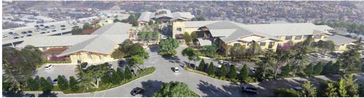
Rendering of the future Lake Forest Civic Center