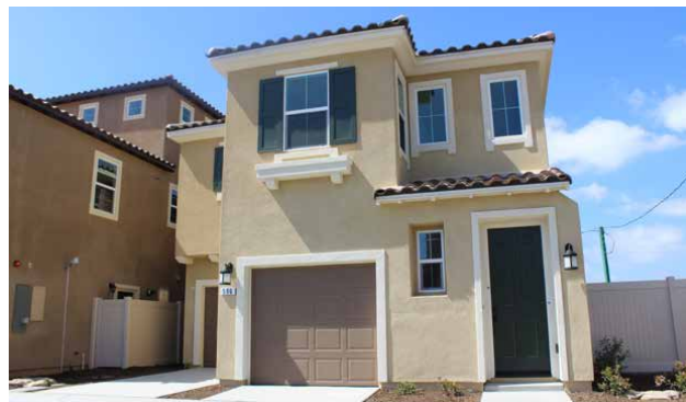
Encanto Model Home

The City Council approved the schematic design in September 2016, which visualizes the building floor plans, elevations, and three-dimensional renderings. Grading will take place in the coming months, with construction of the campus buildings anticipated to commence starting fall 2017. The completed Civic Center is slated for spring 2019. For more information on the Civic Center and to track its progress, visit lakeforestca.gov/civiccenter .