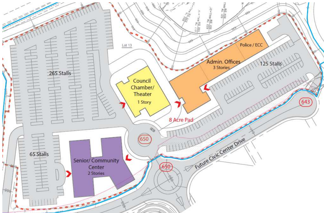
Figure 2: Modified 2011 Conceptual Plan – All Surface Parking

Alternatively, the 2016 Conceptual Plan reserves 60% of the site for programmable area with 40% of the site used to provide the required parking. The 2016 Conceptual Plan maximizes the reduced size and constrained shape of the revised project site by introducing a two-deck parking structure.