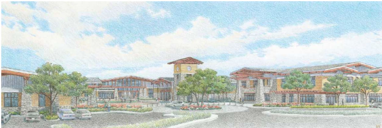
Figure 1: Future Lake Forest Civic Center

The City has reached an important milestone in delivering a permanent Civic Center – Lake Forest’s 100 Year Home – as the City Council reviews the Schematic Design prepared by project architect Carrier Johnson. Based upon public input gathered via public workshops and an online survey, Carrier Johnson updated the 2011 Concept Plan to add dynamic open spaces throughout the project, a pedestrian connection to the Serrano Creek Trail, and a parking deck to reserve 60% of the Civic Center site for programmable area. Carrier Johnson’s schematic design also accommodates the reduced size and unique shape of the Civic Center parcel resulting from the required preservation of the southeastern portion of the site. The Schematic Design includes a Civic Center Master Plan, Site Perspectives, Landscape Concept Site Plan, and floor plans for the Community Center, Senior Center, Council Chamber/Performing Arts Center,