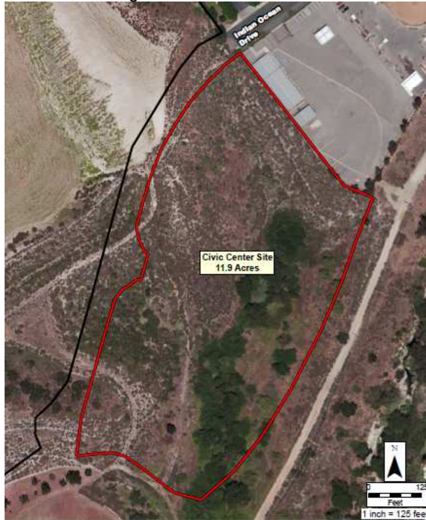
Figure 1. Civic Center Site

The biological reports prepared as part of the required environmental documentation identified an existing drainage feature on the Civic Center site which conveys water from upstream and acts as a tributary to Serrano Creek (See green area on Figure 1 above). Any alteration of this drainage feature requires permits from the appropriate jurisdictional regulatory agencies – the United States Army Corps of Engineers (“ACOE”), California Fish and Wildlife (“CFDW”), and the Santa Ana Regional Water Quality Control Board (“RWQCB”). Per the DA, IRWD is responsible for completing the work related to jurisdictional wetlands permitting and mitigation authorization (i.e., obtaining the environmental permits necessary to develop the Civic Center site) while the City is responsible for off-site environmental mitigation for the Civic Center site that cannot otherwise be provided on-site.