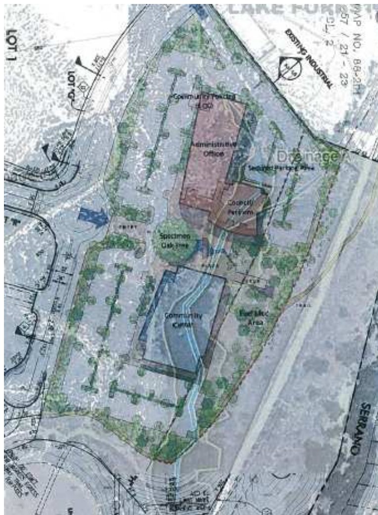
Figure 2. 2011 Civic Center Conceptual Plan Overlaid with Aquatic Resources Integrity Area

In 2013, staff met with the ACOE to discuss the Civic Center Project and submit an updated conceptual plan which reserved 1.5 acres of the site as a mitigation area (i.e., 1.5 acres would remain natural and undeveloped). Subsequently, the City received notification from the ACOE that permitting would be completed under its simpler Letter of Permission (“LOP”) process. However, in October