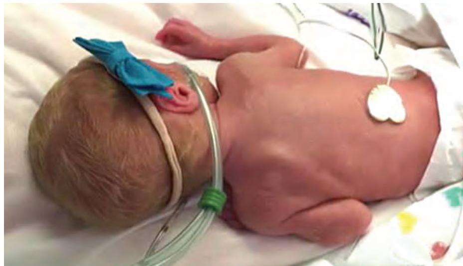
Proprietary private label monitoring electrodes that hold up better than the competition in the hot and humid environment of incubators.