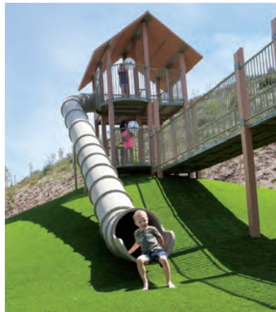
Baker Ranch Community Park with a tunnel slide, towers to climb, and bridges to cross is playtime paradise for kids.

A series of slides, a rock climbing arch, monkey bars, a sand pit—Baker Ranch Community Park is