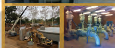
LA BONITA PARK WATER FACILITIES City of La Habra