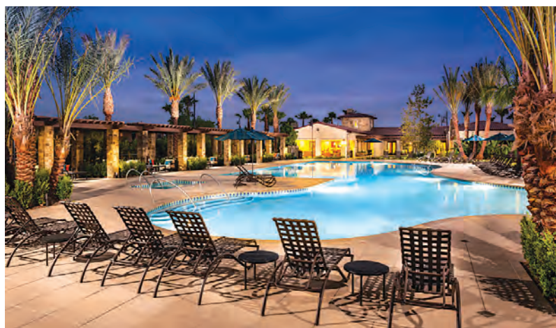
Baker Ranch has many impressive resort-style facilities, but The Grove Clubhouse may be the most spectacular of all.

Rooms, 4–5 bedrooms, and prices from the low $800,000s. Terraces homes have 4–5 bedrooms, 3–4 baths and prices from the low $900,000s. Finally, Summit has Baker Ranch's most spacious homes: 5–6 bedrooms and over 4,000 square feet, prices start at $1.4 million.