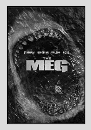
The Meg Wednesday•Feb 27 1 hr 53 mins (PG-13)

A young boy is invited by family to visit Africa. The boy gets lost and finds a friend...an elephant. The boy and the elephant fight together against poaching; together they learn many of life's lessons.