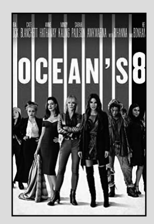
Oceans 8 Wednesday•Jan 30 1hr 54 mins (PG-13)

A woman grapples with running her mother's villa while expecting her first child. The woman worries that she cannot handle everything on her own, so she enlists two of her mother's friends for support and guidance. Along the way, she learns of her mother's past and faces a surprise visit from a grandmother she's never met.