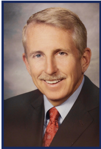
Scott Voigts Mayor District 3