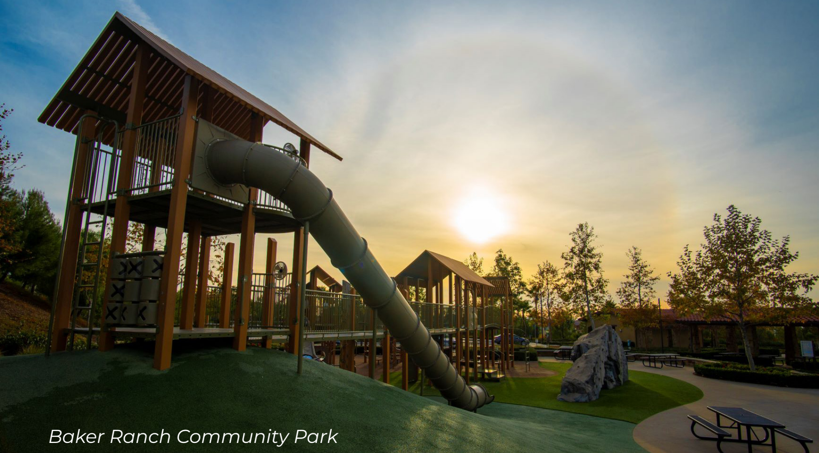
Baker Ranch Community Park