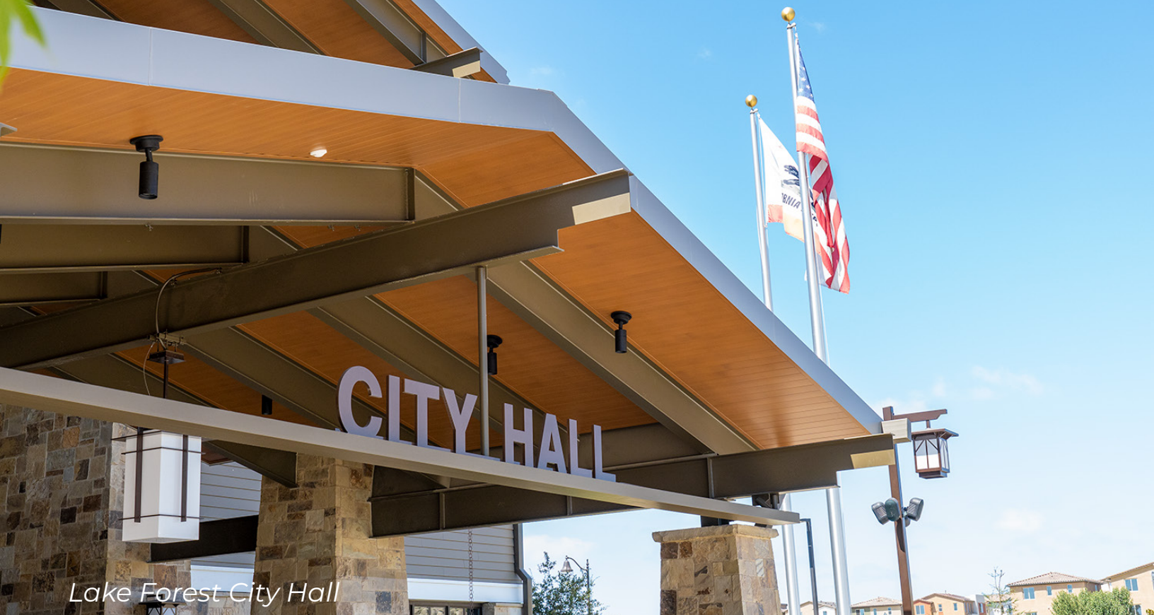
Lake Forest City Hall